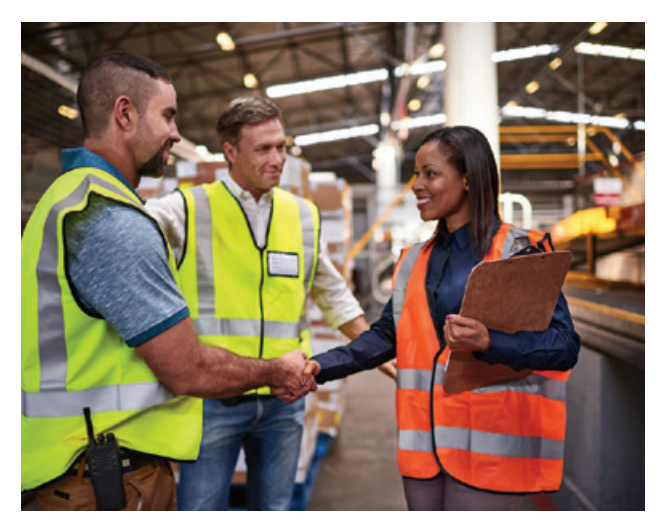
Evoqua is your trusted partner for best-in-class service solutions.