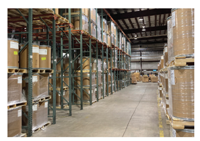
Evoqua's central distribution facility in Rockford, IL

The 166,000 square-foot, multi-level storage facility is strategically located close to UPS ^1 and FedEx ^2 airfreight hubs and other national carrier hubs. The Rockford facility is also staffed with experts in inventory management and shipping, including international protocol.