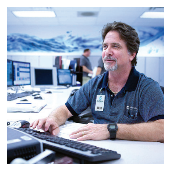
Evoqua will monitor your water system 24/7/365 with real-time visibility and rapid response from our best-in-class service team

Water One services provides a unique solution by combining key technologies with outcome-based water guarantees for reliable water quality and system performance.