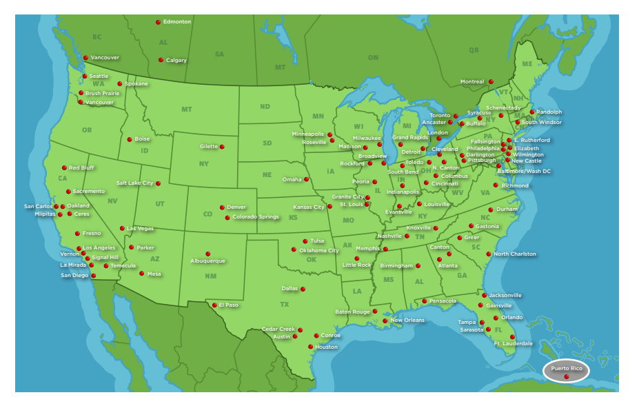
EVOQUA Water Technologies North America Service Network