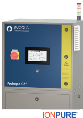
System with optional signal light.

Auf der Weide 10, 89312, Günzburg, Germany