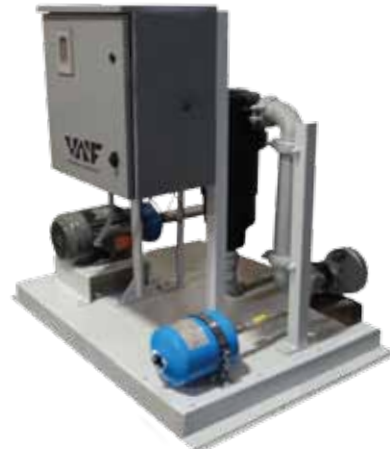
LCFX multiple basin filtration systems are available in flow rates from 11 to 34 m 3 /hr (50 to 150 gpm).