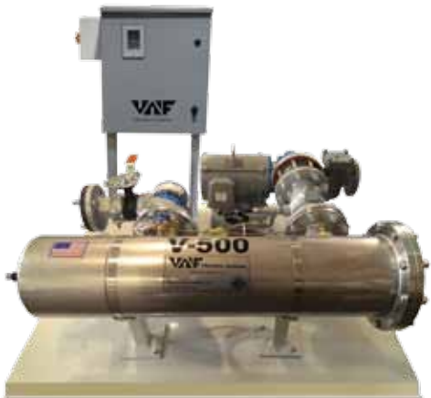
CTFX multiple basin filtration systems are available in flow rates from 34 m 3 /hr (150 gpm) to any flow rate by using multiple filters.