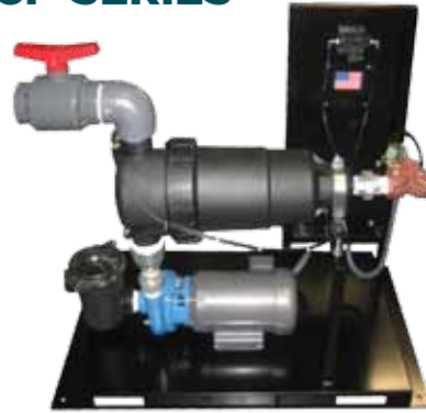
LCF filtration systems have a small footprint and are available with flow rates from 11 to 34 m 3 /hr (50 to 150 gpm).