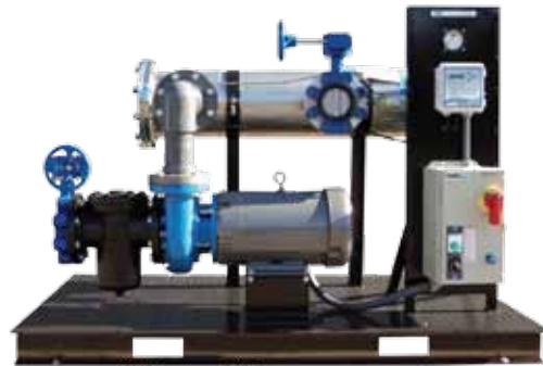
CTF filtration systems have a compact footprint that can be customized to fit constrained areas. Flow rates are available from 34 m 3 /hr (150 gpm) to any flow rate by using multiple filters.