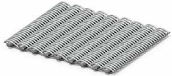
Woven stainless steel filter panels improve solids rejection.

The OTM disc filter panel is woven from 316L stainless steel threads which are attached to a polypropylene structural frame. The OTM media includes a porosity rating or percent open area of \geq 60\% and a strength of 19-22 N/mm. Each panel is equipped with a molded EPDM edge gasket for a watertight seal between the OTM filter panel and the plastic filter support structure of the disc filter housing. The OTM panel is held in place with a molded plastic rim cap secured by conventional stainless steel hardware thereby allowing for easy maintenance and removal/replacement of the individual filter panels.