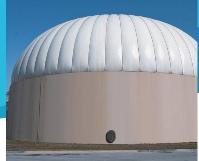
The Dystor® air control system is compact and simple to operate while offering the most advanced technology and safety features.