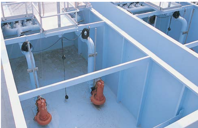
Clearwell, pumps, and control valves are included in the complete denitrification filter steel package.

The conversion of nitrate to free nitrogen is accomplished by denitrifying bacteria that grow on the media surface. The bacteria consume an added carbon source such as Methanol, and use the oxygen in the nitrate molecule. As a result, nitrogen gas is released. As the bacteria population increases, headloss builds up across the cells. Eventually, the filter must be air scoured and backwashed to remove excess bacteria and trapped solids. Air scour loosens the bacteria from the media, allowing the backwash flow to remove the excess bacteria and suspended solids from the filter bed.