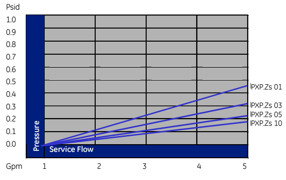
Table 3: Flow Performance in Clean Water<sup>1</sup>