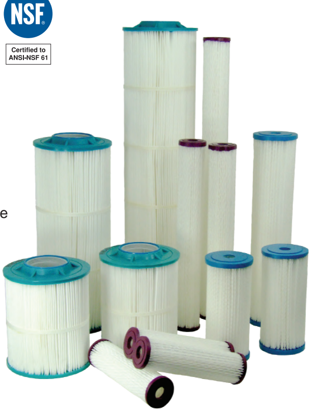
Harmsco® Poly-Pleat™ Series Filter Cartridges

*Big-Blue is a registered trademark of Plymouth Products, Inc.