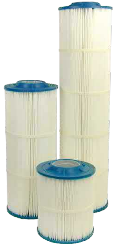
Premium Hurricane® Polyester Cartridges