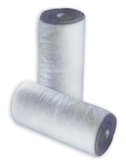
Figure 1: Aquatrex Filters