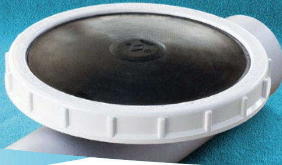
MonoAir™ Single Pod Diffuser