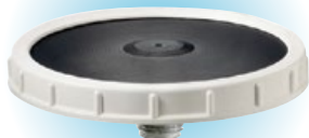
FLEXDISC™ DIFFUSER (THREADED CONNECTION)