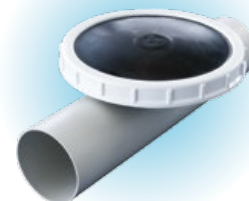
MONOAIR™ MEMBRANE DIFFUSER