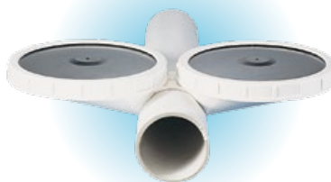
DUALAIR® MEMBRANE & CERAMIC DIFFUSER