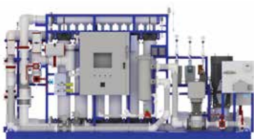
Vantage® UFI System Mid-Range Skid (12 module skid)