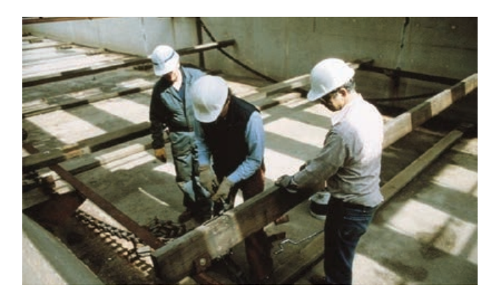
Installation and aftermarket services are available to plant operators and managers to help protect equipment and the investment in utility assets.

Components and systems age at varying rates with some parts remaining useful while others are in imminent danger of failing. Often, the failure of vulnerable components can trigger larger failures and result in damages and/or compliance issues.