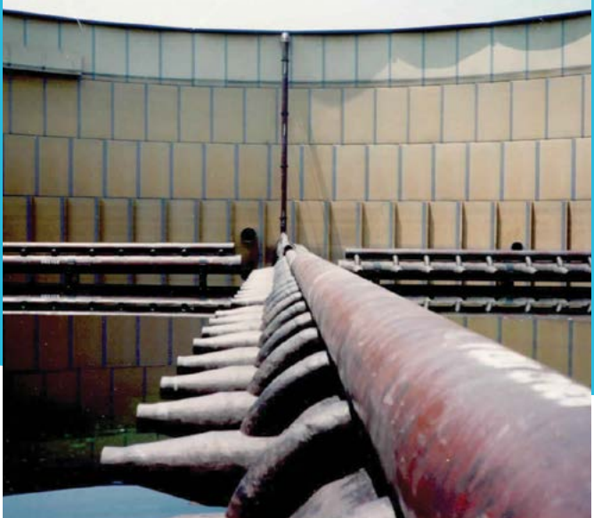
VARI-CANT® Jet Mixing System installed in circular basin.