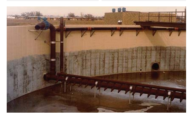
Pneumatic Backflush Cleaning System