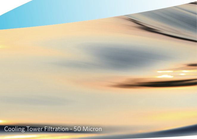
Cooling Tower Filtration - 50 Micron