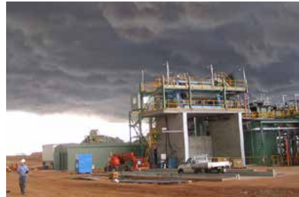
Your ToolDOX content is available on your mobile or tablet device regardless of internet availability.

Contact your sales representative today for more information, or to schedule an online demo.