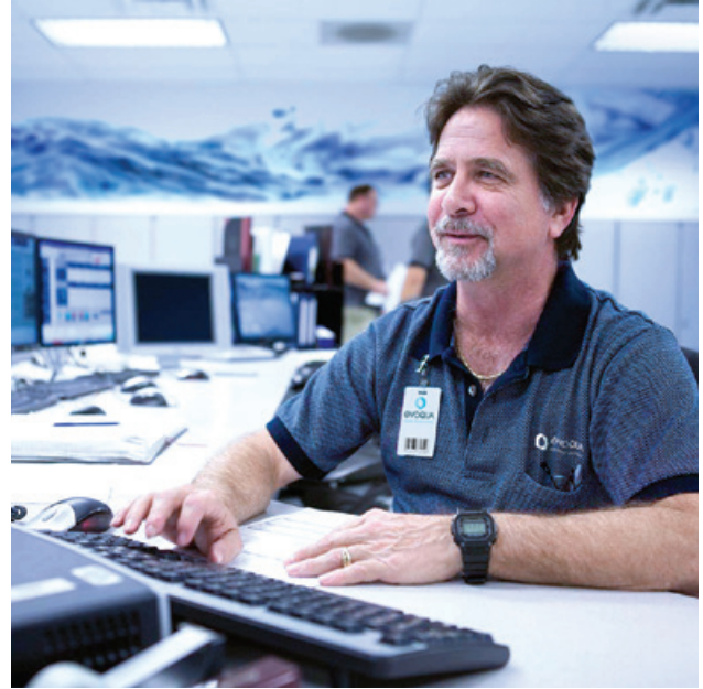
Evoqua will monitor your water system 24/7/365 with real-time visibility and rapid response from our best-in-class service team

Water One services provides a unique solution by combining key technologies with outcome-based water guarantees for reliable water quality and system performance.