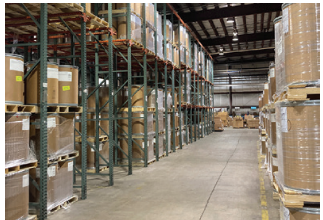
Evoqua's central distribution facility in Rockford, IL

The 166,000 square-foot, multi-level storage facility is strategically located close to UPS 1 and FedEx 2 airfreight hubs and other national carrier hubs. The Rockford facility is also staffed with experts in inventory management and shipping, including international protocol.