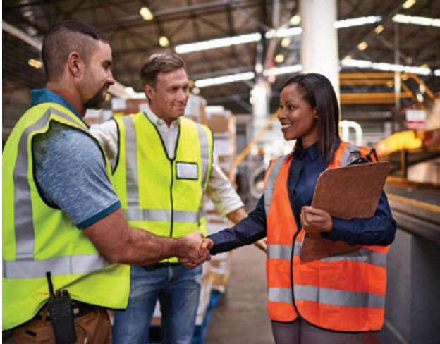
Evoqua is your trusted partner for best-in-class service solutions.