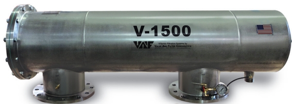
Horizontal design for ease of installation

Other micron, larger flows, DIN flanges, BSP threads and customizing available upon request.