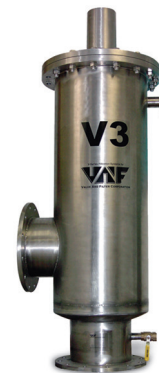
Vertical design for minimal footprint