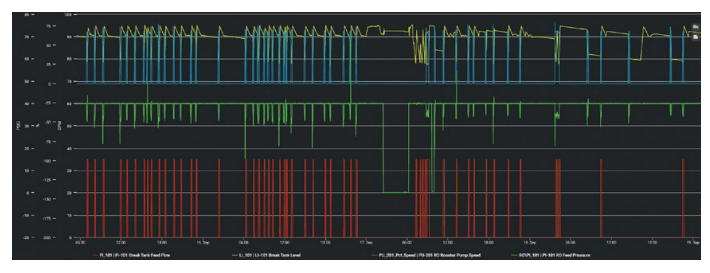
Figure 1: USP Purified Water Generation System Operating Data

capacity. Based on the pattern, the next cycle was predicted, and Evoqua service technicians were able to proactively make pump repairs without impacting production.